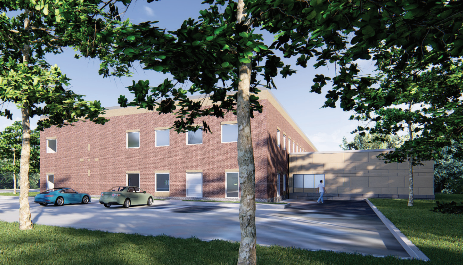
This rendering of the new Cancer Care Center at 81 Medical Center Drive shows the exterior of the building, including the new vault for the linear accelerator.