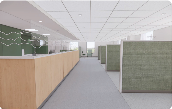
The new IV therapy space will feature a comfortable layout and provide patient privacy.