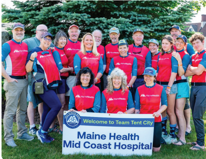
The 2025 MaineHealth Mid Coast Hospital Trek Across America team.