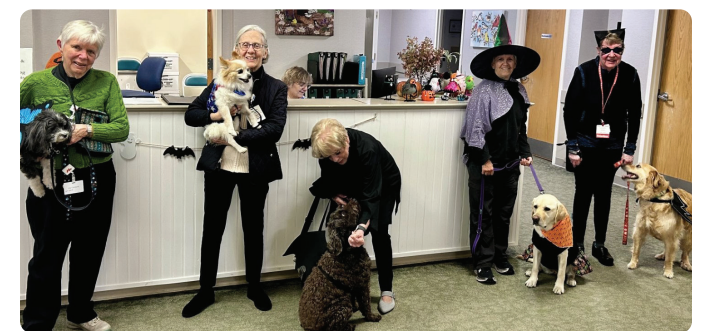
Pet therapy volunteers and their pups participated in a Halloween Parade at the Senior Health Center this year.