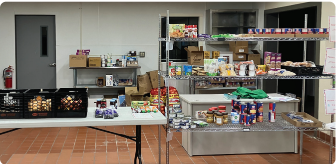
The new food pantry at the MaineHealth Parkview Campus is a resource for both patients and care team members.

This initiative is made possible through a partnership with Mid Coast Hunger Prevention Program and through the dedication of our care team members who refer patients and help spread the word.